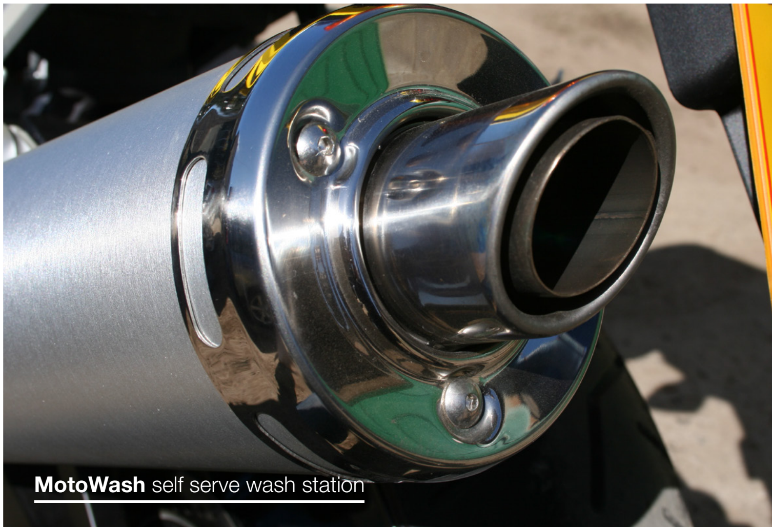
MotoWash self serve wash station